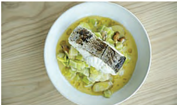
‘In a puddle of buttery broth bringing it all together’: hake, mussels and leeks.

That is the case for the prosecution. Here then is the defence: at lunchtime, when it’s a short à la carte, the Lookout is worth busting your lungs for. The view is spectacular, even when the cloud-base is descending on the city like a duvet being chucked over a bed, but you won’t look up much because the food is so diverting. It is simple ideas, well executed, using great ingredients in the service of big flavours.