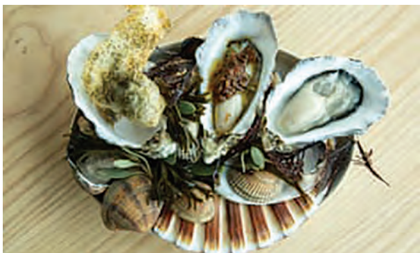
‘With a deep, rich rust sauce’: rock oysters.

Taxis can drop off, though it’s still a walk from the road. Otherwise, it’s a major yomp uphill because there’s no parking. No one would describe it as a model of accessibility. On a beautiful Edinburgh summer’s day when the sun barely bothers to set, this could be joyous. I go on a late November day, when half the North Sea is being deposited on the hilltop. I feel intrepid simply for getting to the door.